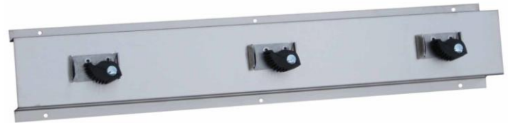
*ML981_3 image shown